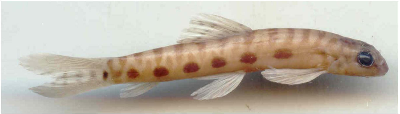
Image 1. Nemacheilus stigmofasciatus sp. nov., holotype, F 7599, 37.6 mm SL.