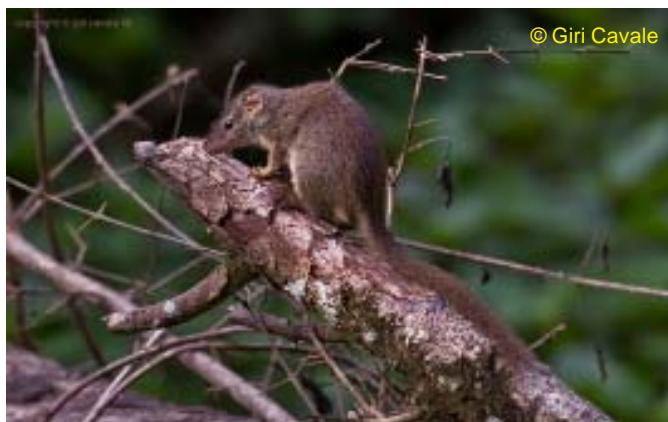
Image 2. Madras Tree Shrew Anathana ellioti coming down a Terminalia tree at K Gudi, BR Hills on 10.xii.2006.