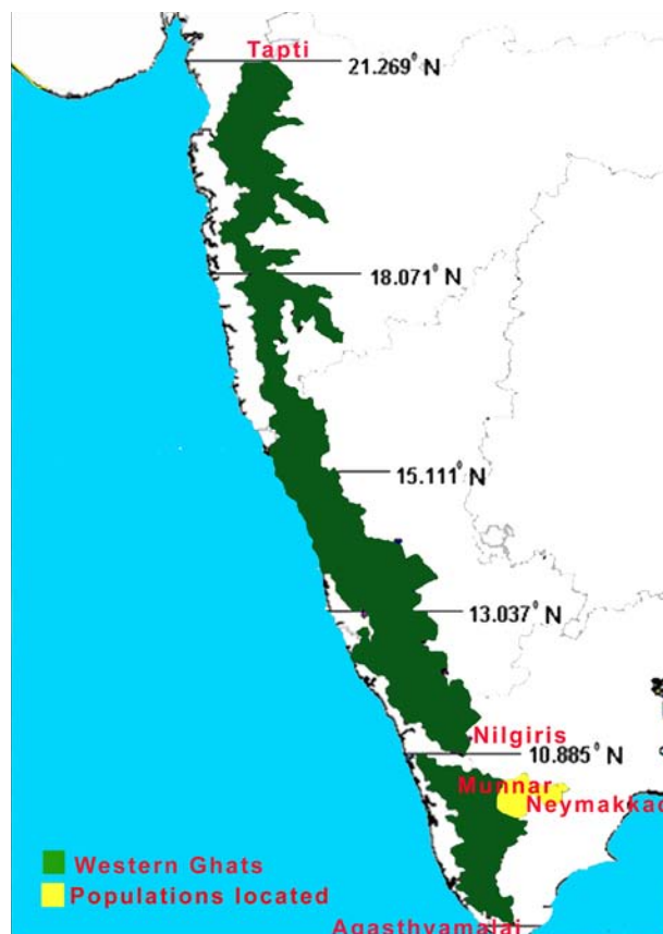
Figure 1. The study area in the Western Ghats

In India, the concentration of Impatiens species is remarkably local and occurs in three major centers of diversity including the Himalaya in the north, Western Ghats in the south and parts of northeastern states. Although the altitude in southern India is lower compared with the Himalaya, conditions are favourable for the growth of Impatiens since the region gets rainfall from both southwest and northeast monsoons. There is no doubt that in respect of Impatiens , the Western Ghats are the second richest area in the Indian subcontinent and perhaps in the World (Bhaskar 1981). The genus contains over 206 species in India (Vivekanathan et al. 1997; Vishwanathan & Manikandan 2003; Bhaskar 2006), half of which occur in southern India and more than 86 are endemic to the Western Ghats (Nair 1991). Due to their restricted distribution, nearly 30 species of Impatiens are already threatened with uncertain future (Vajravelu & Daniel 1983; Pandurangan & Pushpangadan 1997; Sreekala et al. 2008).