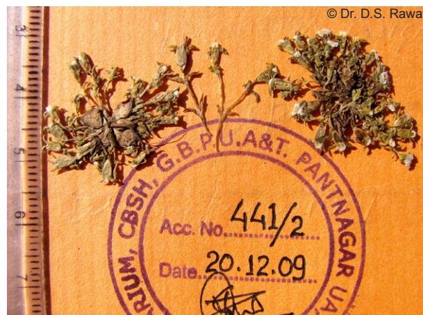
Image 3. Gentiana tetrasepala Biswas