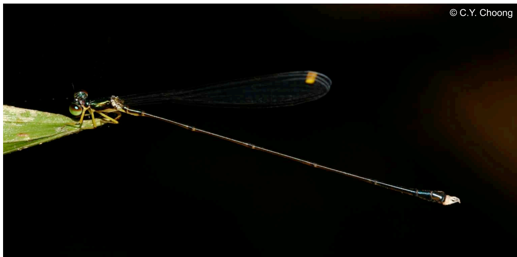
Image 5. Amphicnemis bebar male.