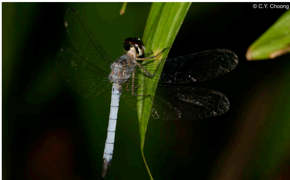
Image 9. Tyriobapta laidlawi male.

— 1:1 male, RAD, 21.ix; 1 male, CYC, 24.ix.