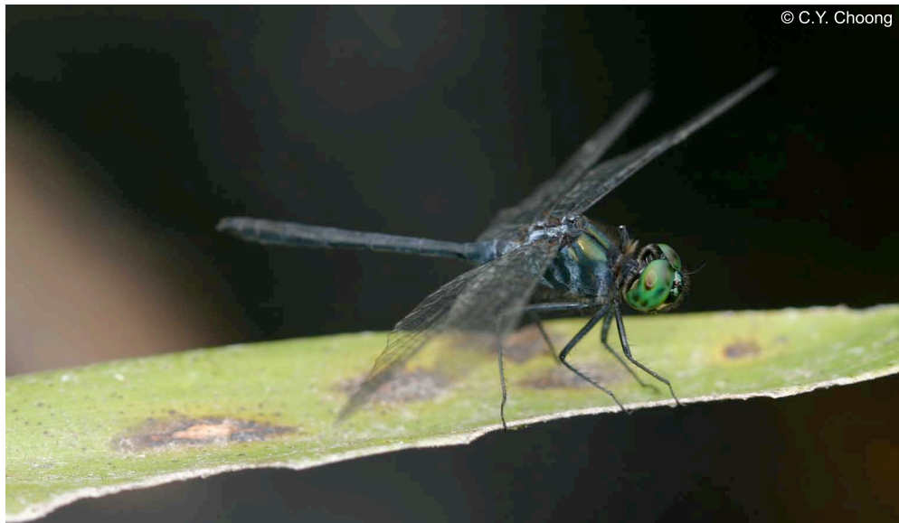
Image 8. Chalybeothemis fluviatilis male.