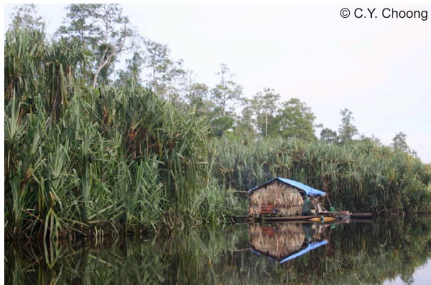
Image 1. The Sungai Bebar.