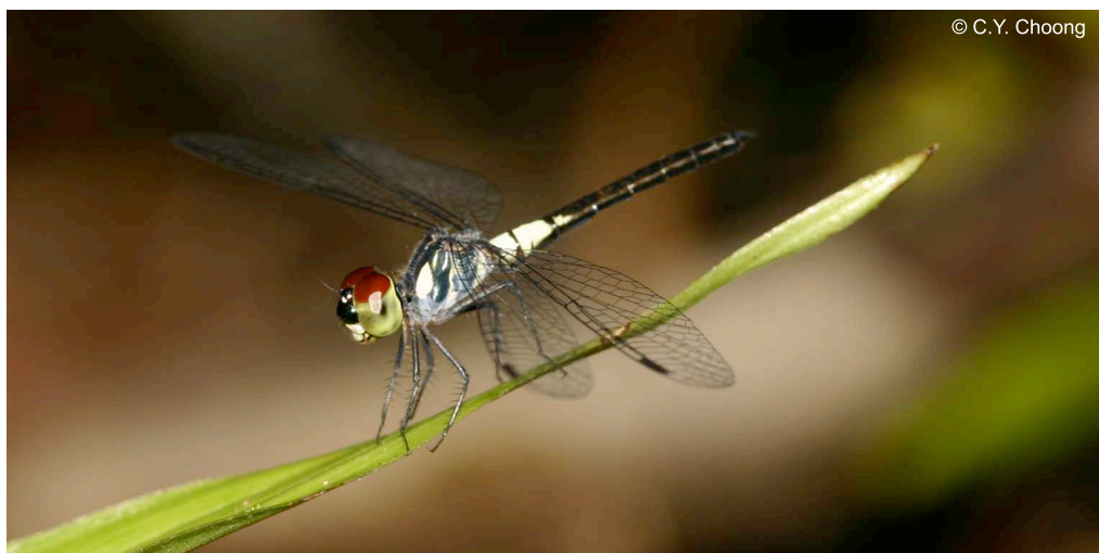
Image 6. Amphicnemis hoisen male.