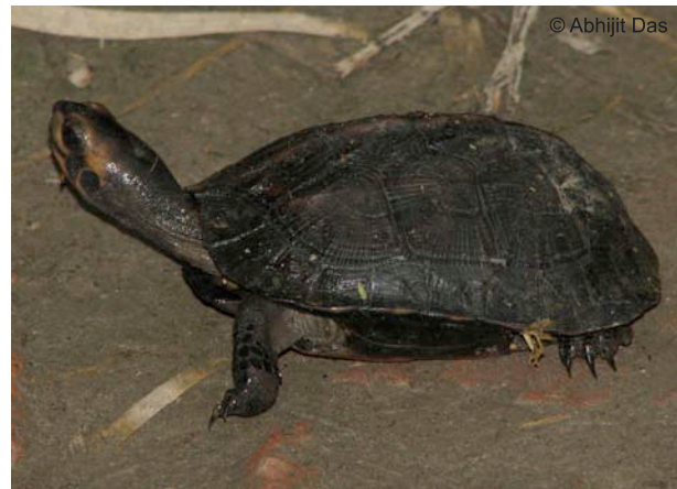
Image 15. Melanochelys trijuga