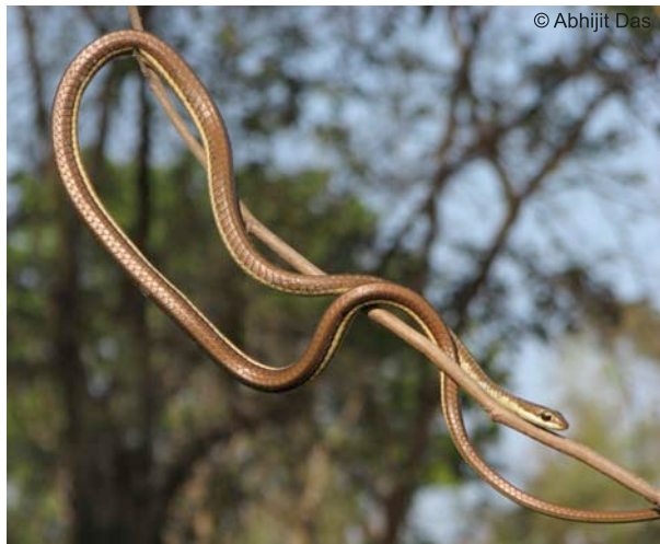
Image 8. Dendrelaphis tristis