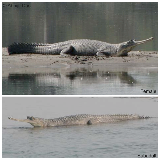
Image 21. Gavialis gangeticus

palustris , Nilssonia gangeticus , Pangshura tentoria , Dendrocygna javanica and Tadorna ferruginea . The highest count for a single day was 105 individuals on 09 December 2008 of which 35 were recognized as adults. Largest number of adult males with “gharas” were eight on 20 December 2008. During high water in June–July, large individuals were observed inside small sub channels, 1–2 km from main river channels. Communal nesting was observed on a 40m long and 6–7 m wide sandy island with grassy patches. Nesting began in March. Nests were observed as 32–40 cm deep. One nest had 46 eggs. Average size of the eggs measured 82.21 x 60.07. Hatchlings measuring SVL 132–150 mm, TL 180–190 mm (N = 5) observed on 16 June 2008. Five to six hatchlings were seen taking refuge near grassy roots or in depressions along the