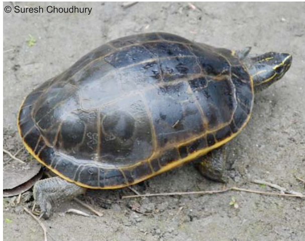
Image 17. Morenia petersi