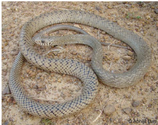
Image 10. Ptyas mucosa