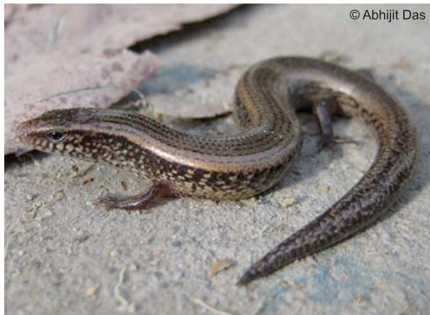
Image 6. Lygosoma punctata

2002). We observed juveniles during the month of December.