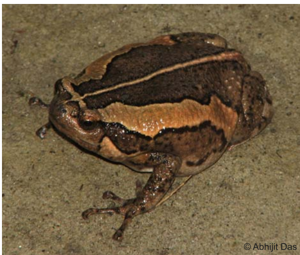
Image 2. Kaloula sp.