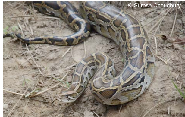
Image 7. Python bivittatus

Ramphotyphlops brahminus (Daudin, 1803): Found inside a cracked floor of the base camp at