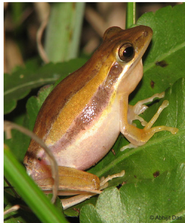
Image 3. Polypedates taeniatus

Type locality of the species is Purnia (Bihar). We observed a colour photograph of the species from