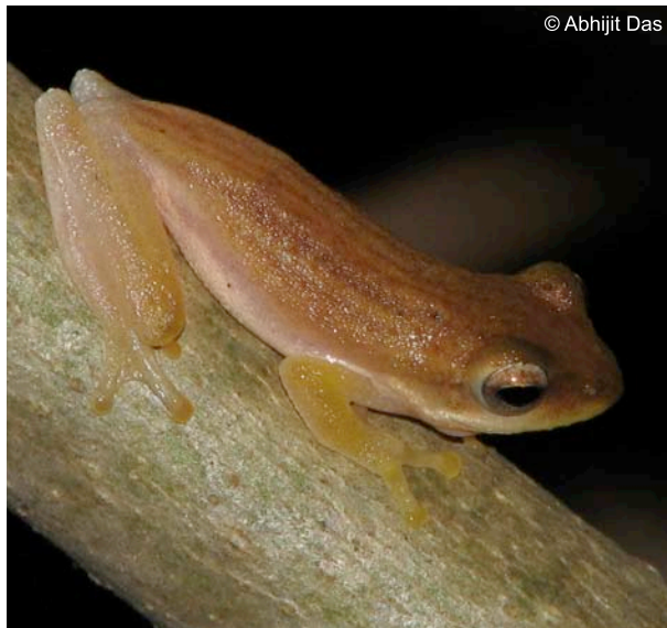
Image 4. Chiromantis dudhwaensis