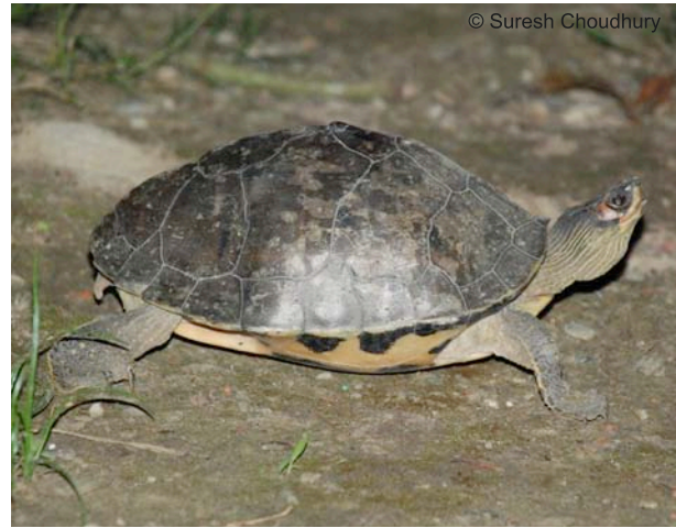
Image 18. Pangshura tectum

trail surrounded by extensive terai grassland. The males carry a distinct plastral concavity. One female (PL 115mm, SCL 135mm) was recorded during March 2009 while it was crossing grassland trail at 0850h.