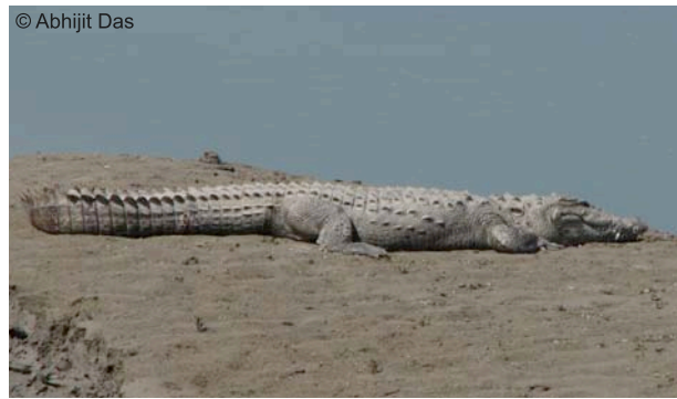
Image 20. Crocodylus palustris