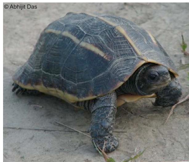
Image 16. Melanochelys tricarinata