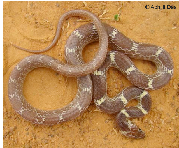
Image 9. Lycodon aulicus

sighting is from the Katerniaghat Forest Range Office while it was moving among leaf litter of a teak plantation area during June 2008. Subsequently, on 14 June 2008, one dead female was observed on a forest trail surrounded by Terai grasslands.