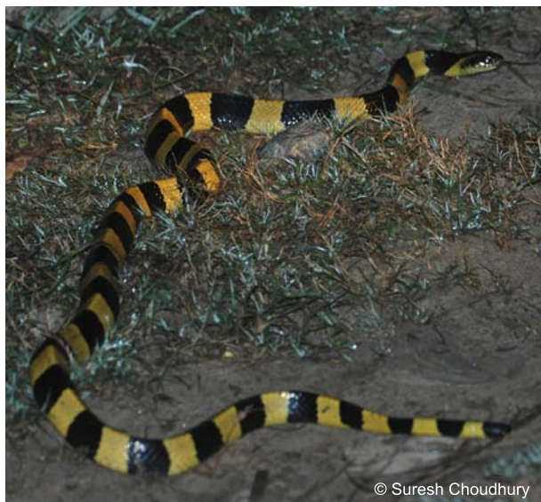
Image 12. Bungarus fasciatus