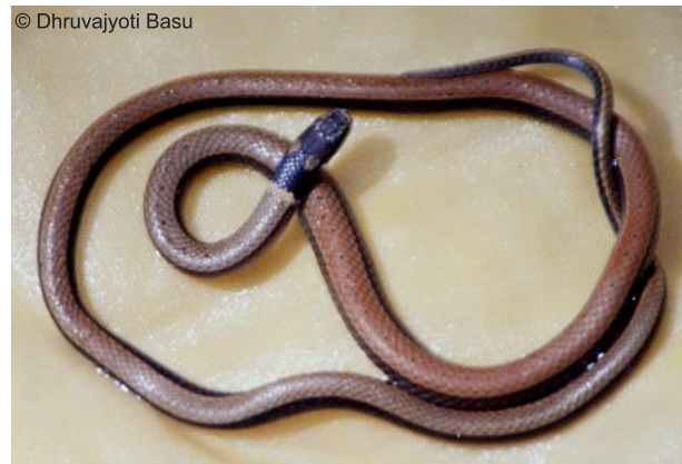
Image 11. Sibynophis sagittarius