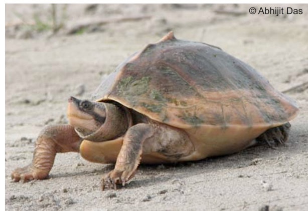
Image 19. Pangshura tentoria flaviventer

Pangshura tentoria (Gray, 1834) (Image 19): Most frequently observed turtle species during the study period. Sighting records are from Boat point, watch tower, Amba and Bhabanipur. Individuals frequently observed while basking on river-side logs as well as in mid river. Individuals also observed on