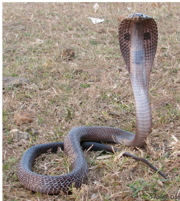
Image 13. Naja naja

It is not conclusively known if double clutching occurs in the species in which case the first clutch could be laid at the beginning of the rainy season in July or