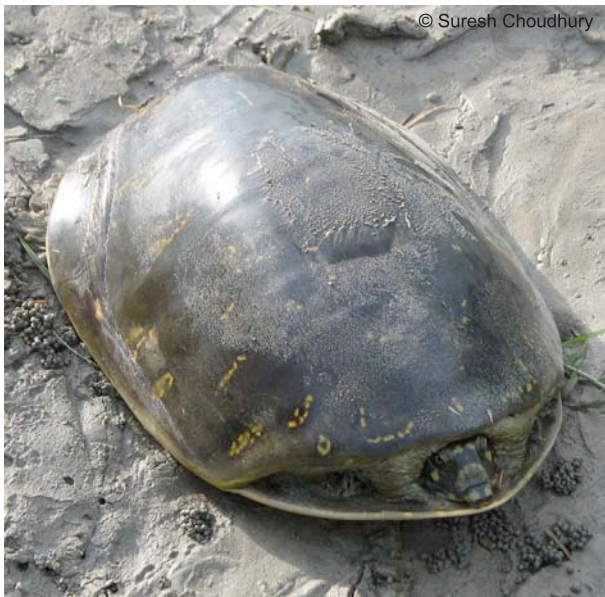
Image 14. Lissemys punctata andersoni