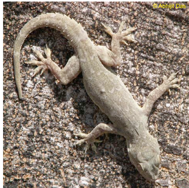
Image 5. Hemidactylus flaviviridis