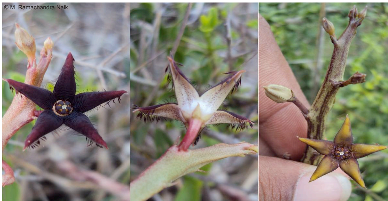
Image 1. Close-up view of Caralluma stalagmifera var. longipetala