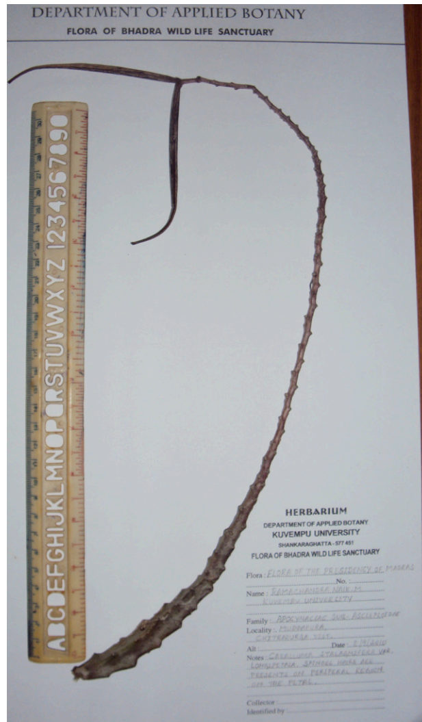
Image 3. Herbarium of Caralluma stalagmifera var. longipetala