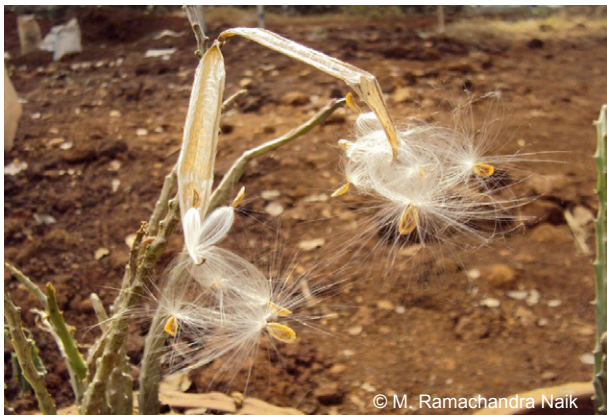
Image 2. Seed dispersal of Caralluma stalagmifera var. longipetala