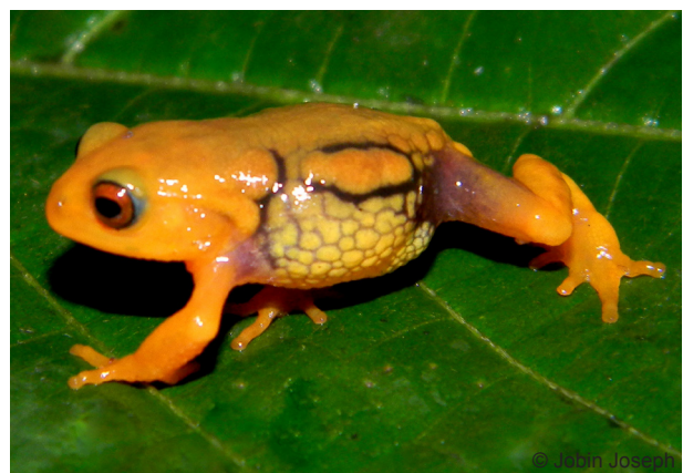
Images 4 and 5. Raorchestes resplendens at Poovar, Eravikulam National Park, May 2012