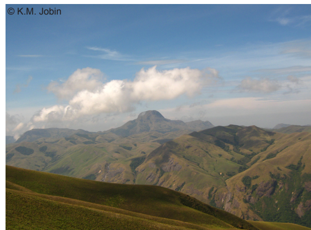
Image 2. The view of Anamudi peak, from the Poovar, in Eravikulam National Park