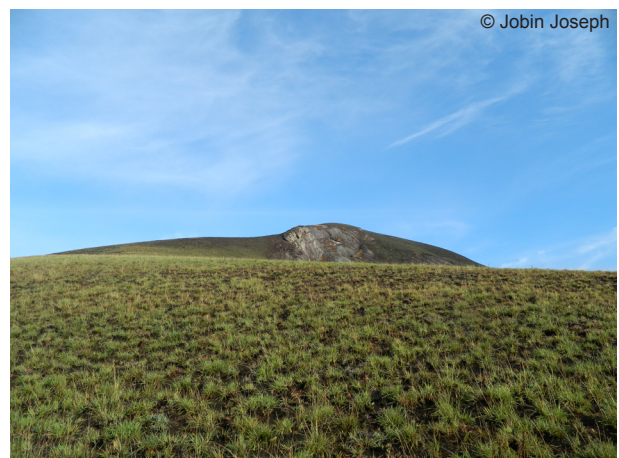
Image 3. The view of the habitat of Raorchestes resplendens at Poovar, Eravikulam National Park