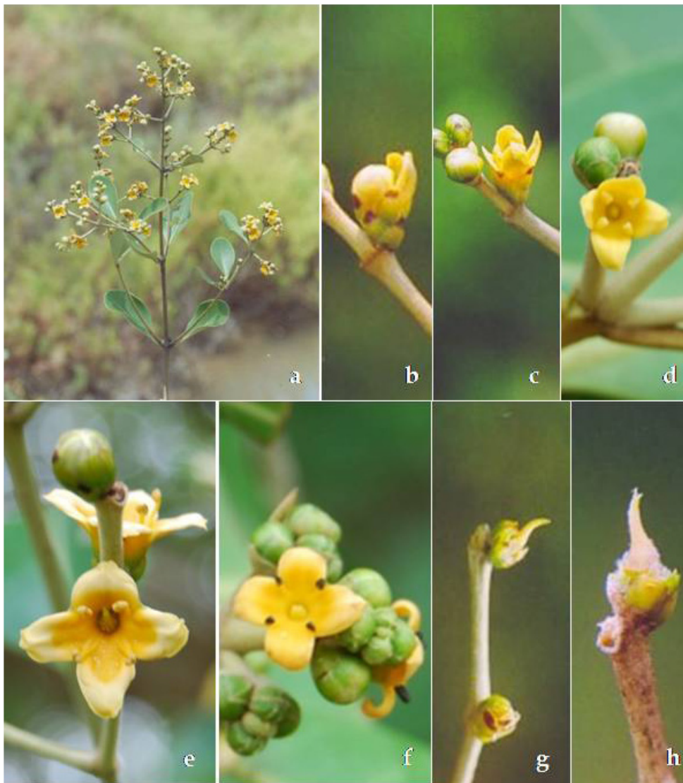
Image 3. Avicennia officinalis . a - Flowering branch; b–d - Different stages of anthesis; e - Flower with bent unreceptive stigma with dehiscent anthers; f - Flower with erect receptive stigma and withered anthers; g - Unreceptive stigma; h - Receptive stigma.

Junonia lemonias , J. hierta (Image 4i), a fly (Image 4f) and a wasp (Image 4g) (unidentified) in A. officinalis . The flies visited the flowers in groups while all other insects visited individually. The bees were both pollen and nectar feeders while all other insects only nectar feeders. All the insects probed the flowers in upright position to collect the forage. In case of Xylocopa bees, they made audible buzzes while collecting nectar aliquots from the petals. Butterflies landed on the petals, stretched their proboscis to collect nectar aliquots on the petals and at the flower base. In this process, all the insects invariably touched the anthers and the stigma; the ventral side of all insects was found powdered with pollen. Further, the body washings of