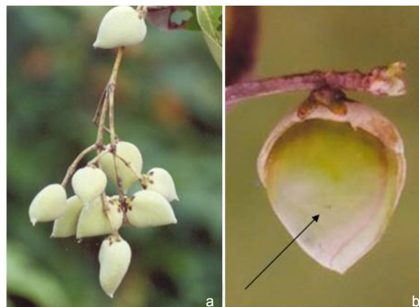
Image 5. Avicennia officinalis a - Fruit set in open-pollinations; b - Propagule.

All the three Avicennia species studied are principally polyhaline evergreen tree species. These tree species show flowering response to monsoon showers in June; the first monsoon showers seem to provide the necessary stimulus for flowering. Opler et al. (1976) and Ewusie (1980) have reported such a flowering response to light rains in summer season in a number of plants occurring in coastal environments. The flowering period extends until August in all the three species of Avicennia at the study sites, indicating