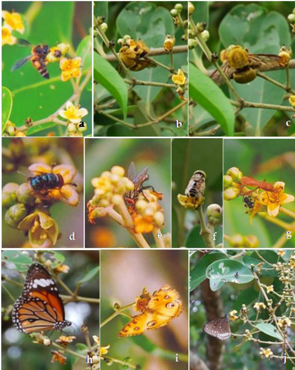
Image 4. Avicennia officinalis - Flower visitors. a - Apis dorsata ; b & c - Xylocopa sp.; d - Chrysomya megacephala ; e - Sarcophaga sp.; f - Unidentified fly collecting nectar; g - Wasp (unidentified); h - Danaus genutia ; i - Junonia hierta ; j - Euploea core .

persistent reddish brown calyx. It is 40mm long, 15mm wide in A. alba , 30–35 mm long, 25mm wide in A. marina and 30mm long, 25mm wide in A. officinalis . It is abruptly narrowed to a short beak and hairy throughout. Seed produces light green, hypocotyl which completely occupies the fruit cavity (Image 5b). Fruit set to the extent of 6% in A. alba and to the extent of 4% in A. marina was damaged by the Rose-ringed Parakeet Psittacula krameri which fed on the concealed hypocotyl in fruits and such fruits were found to be empty. In all three Avicennia species,