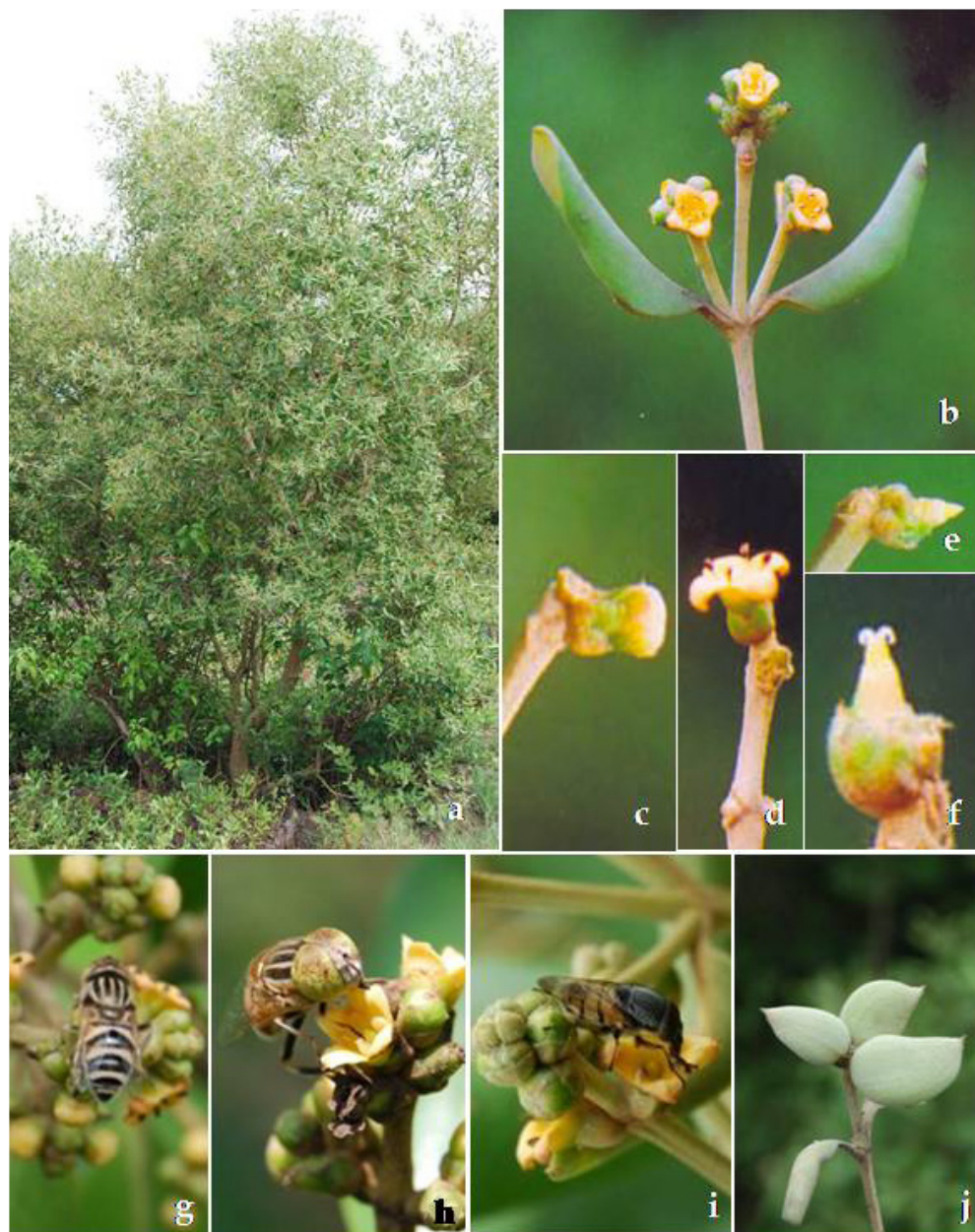
Image 2. Avicennia marina : a - Habitat; b - Flowering inflorescence; c - Mature bud; d - Flower; e - Stigma condition at anthesis; f - Bifid stigma on the 2nd day; g-j - Flower visitors collecting nectar (g - Unidentified fly; h - Eristalinus arvorum ; i - Rhyncomya sp.; j - Fruit set in open-pollinations)

spontaneous autogamy, 33.33% in hand-pollinated autogamy, 40% in geitonogamy, 68% in xenogamy and 55% in open pollination (Image 2j) (Table 1). In A. officinalis , the fruit set is 21.42% in spontaneous autogamy, 42.85% in hand-pollinated autogamy, 63.33% in geitonogamy, 67.85% in xenogamy and 58.13% in open pollination (Image 5a) (Table 1).