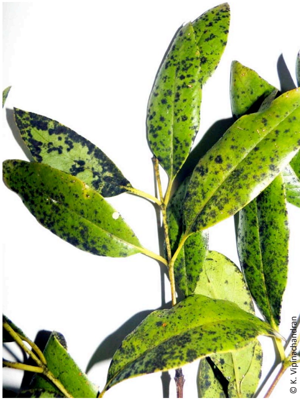
Image 1. Black mildew infected twigs of Santalum album