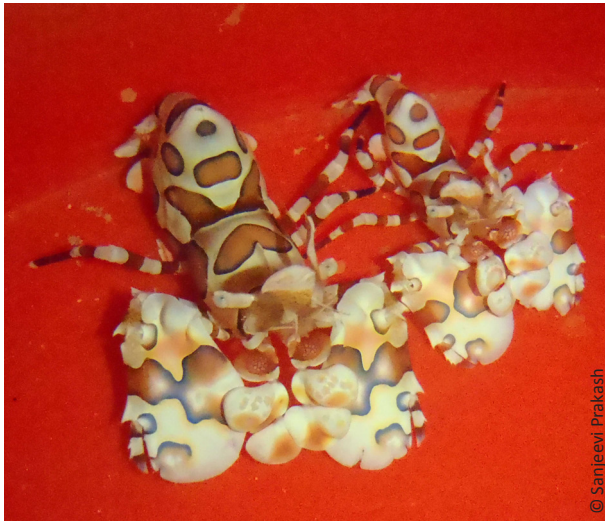
Image 1. A pair of Harlequin shrimps Hymenocera picta Dana, 1852 (Hymenoceridae) collected from Lakshadweep waters.

paired mate. While feeding, the shrimp covered the food with its larger claws touching it with several of its walking legs as if riding on it. First, the smaller male pierced the tubed feet of the Sea Star at the outer edges, which helped to make the prey upside down to facilitate easy feeding (Image 2b). Initially, the male alone lifted the prey with its legs and a major pair of larger claws, while larger female stayed in position and spent some time moving around (Image 2c). In the case of mated pairs, if the male failed to lift the prey, the female slowly approached the prey to help the male. (Image 2d). Both the individuals were highly involved in moving around the edges of the starfish's legs to pierce the tubed feet, which helped them to lift their prey (Image 2e,f) (Video 1). Finally, after about 30–60 minutes, the Sea Star was turned upside down with the efforts of both individuals. The feeding initiated by Hymenocera individuals was started from the outer edges by piercing the epidermis of the Sea Star with its first pair of legs, which possess tiny and sharp chelae. Further, the shrimps pulled out and ate the internal ambulacral feet and gonadal tissue of the prey.