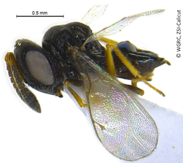
Image 3. Psilocera keralensis sp. nov. Female body profile

Head (Images 3,4): 1.2× as broad as mesosoma; width, in dorsal view, 2.15× length, and in front view width 1.14× height; anterior margin of clypeus projecting