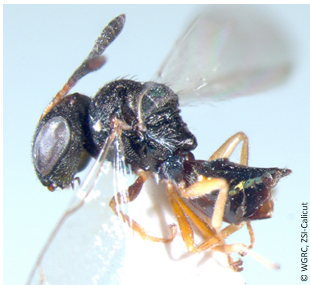
Image 1. Psilocera namdaphaensis sp. nov. Female body in profile

Metasoma: Petiole distinct; gaster lanceolate,