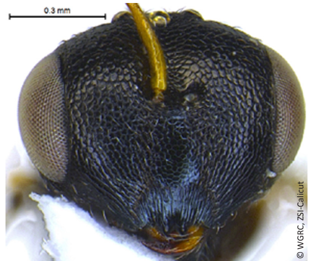
Image 7. Psilocera keralensis sp. nov. Male head in front view.