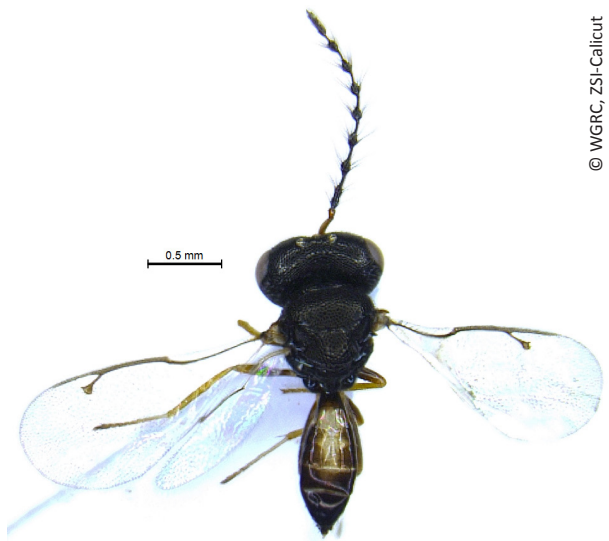
Image 6. Psilocera keralensis sp. nov. Male body in dorsal view.

a little below lower level of head, distinctly bidentate; POL slightly longer than OOL (12.5: 11.5); temple length 2\times eye height; scrobe deep; malar sulcus distinct; eye height 2\times width; head moderately reticulate with moderate, sparse, white pubescence; reticulation on gena and vertex fine, round area below toruli smooth; clypeus radiately striated, striae reaching beyond clypeal margin to paraclypeal area. Antenna inserted below middle of face, above lower ocular line; pedicel plus flagellum length 0.9\times head width; anelli transverse,