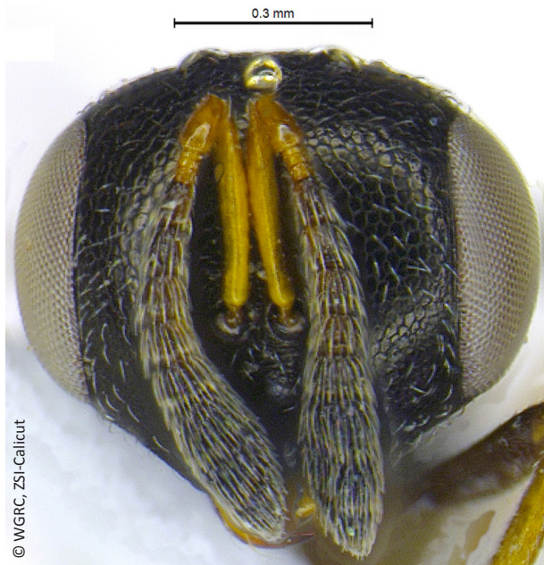
Image 4. Psilocera keralensis sp. nov. Head in front view