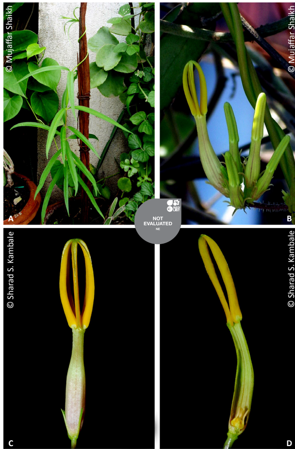
Image 1. Ceropegia odorata Nimmo ex J. Graham A - habit; B - inflorescence; C - single flower; D - L.S. of the flower.

Specimens Examined: 4501, 04.Viii.2012, 21°27'50.59"N & 76°24'04.72"E, Mashak Pahar, Nepanagar Tehsil, Burhanpur District, Madhya Pradesh, India, coll. M. Shaikh (deposited at Herbarium of SNPG Govt. College, Khandwa, Madhya Pradesh); 4561, 05.vi.2013, tuber collected from Mashak Pahar and grown in Garden, coll. M. Shaikh (deposited at Government College Bhikangaon, Madhya Pradesh).