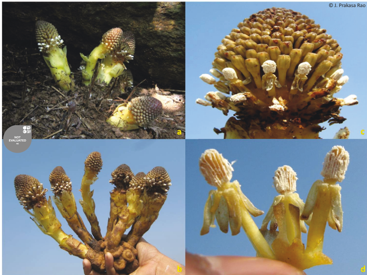
Image 1. Balanophora fungosa J.R. Forster & G. Forster a - habit; b - whole plant with rhizome; c - male inflorescence; d - separated male flowers