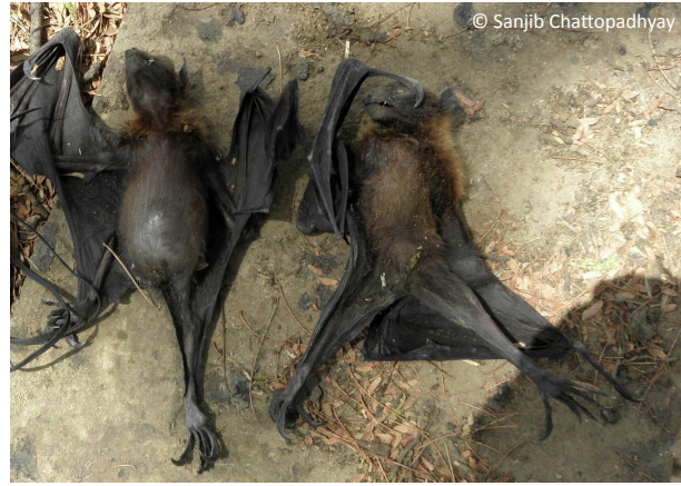
Image 4. A failure of thermoregulatory mechanisms eventually lead to death. Two dead bats shown in this figure had fallen from their roosting tree on to the ground.

matrices revealed a negative relationship (Pearson's r = -0.71 , p < 0.05 ) between bat abundance and ambient temperature, while a positive correlation (Pearson's r = 0.68 , p < 0.05 ) was found between the number of dead bats and ambient temperature.