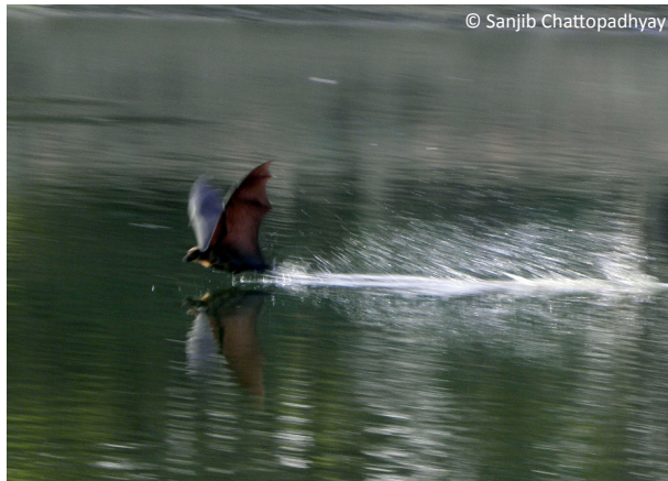
Image 3. Bat displaying the belly-soaking activity as a part of the thermoregulatory mechanism to avoid extreme temperatures.