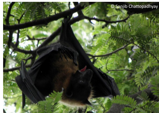
Image 2. Panting behaviour as a part of thermoregulatory mechanism shown by bats from the present study location.

the total population count (Table 1). However, as the ambient temperature crossed the tolerance limit with most of the water bodies having dried up, the bats were found to become lethargic in their behaviour and those who failed to migrate to alternative cooler roosting sites, eventually died (Image 4). Correlation