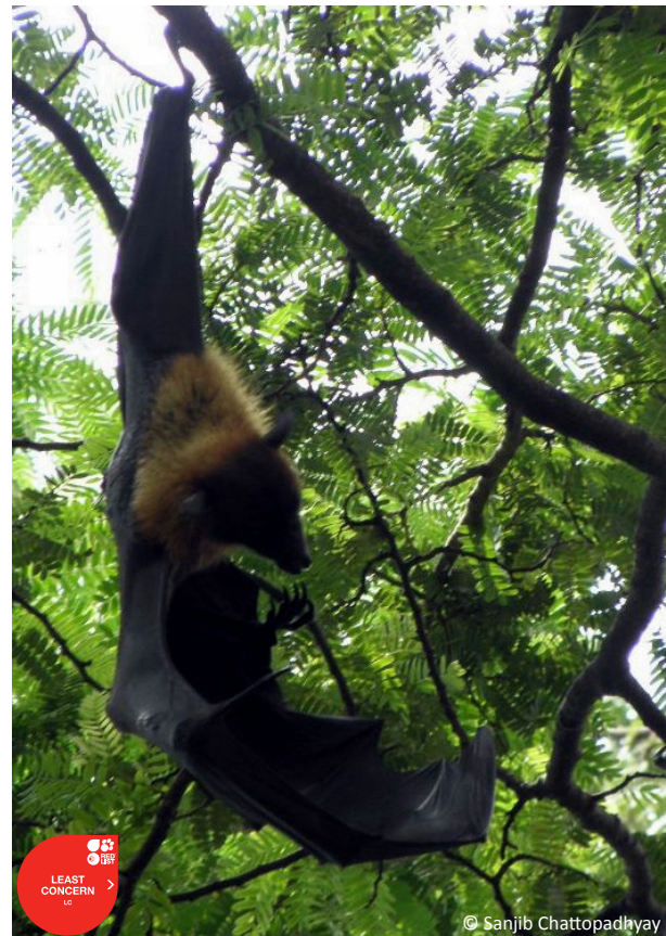
Image 1. Bat showing stretching and fanning behaviour of patagium to avoid excessive ambient temperature.