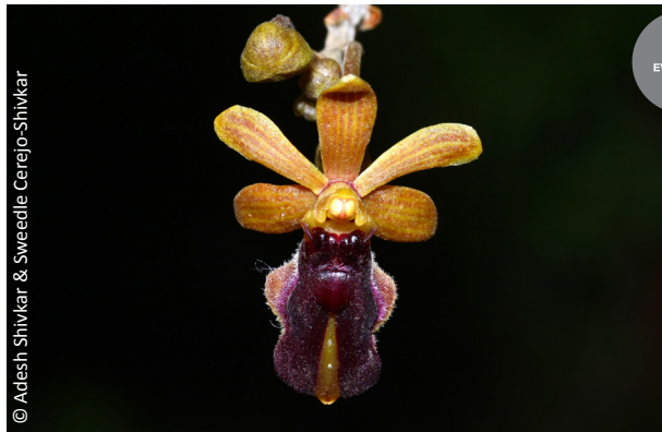
Image 4. Cottonia peduncularis

Phorophyte : Tectona grandis , Mangifera indica