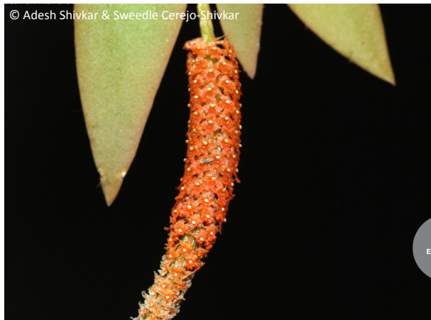
Image 10. Oberonia recurva