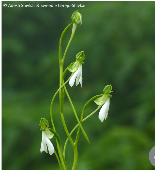
Image 8. Habenaria longicorniculata