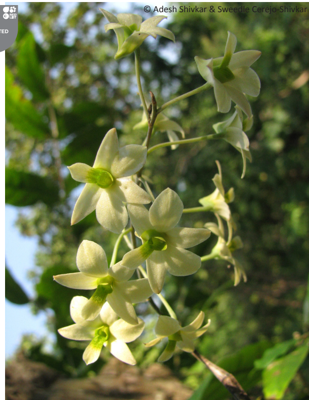
Image 5. Dendrobium ovatum