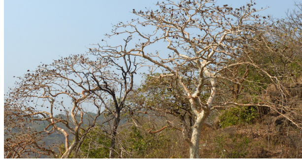
Image 2. Sanjay Gandhi National Park forest in summer