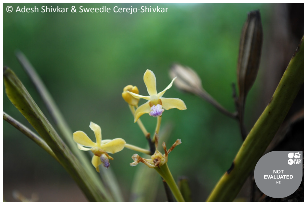
Image 12. Vanda testacea