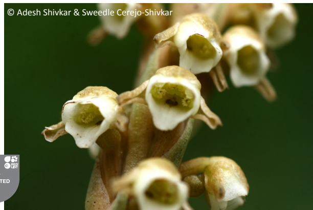
Image 11. Peristylus plantagineus