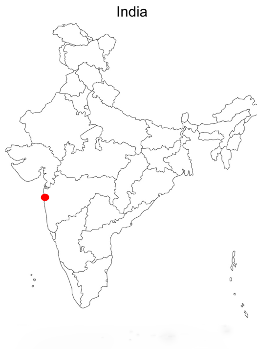
Figure 1. Sanjay Gandhi National Park (© Sunjoy Monga 2003; map not to scale) along with Map of India (©Bruce Jones Design Inc 2010)