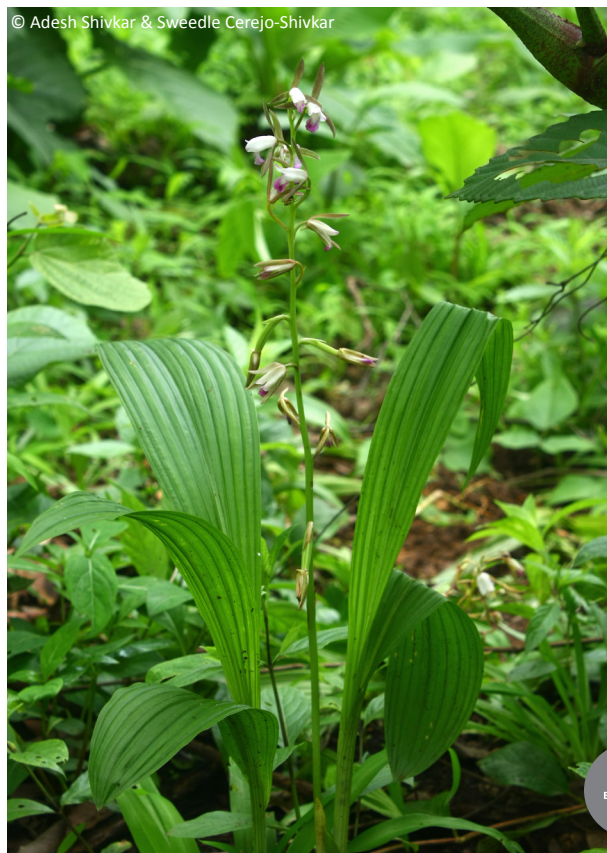
Image 6. Eulophia herbacea