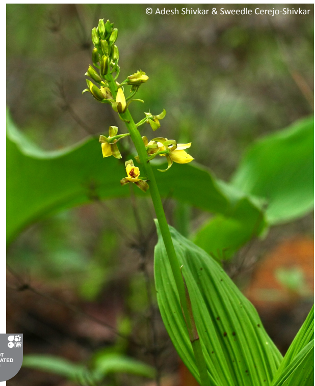
Image 7. Eulophia ochreatea

Notes : Grows in the shade of shrubs; soil enriched