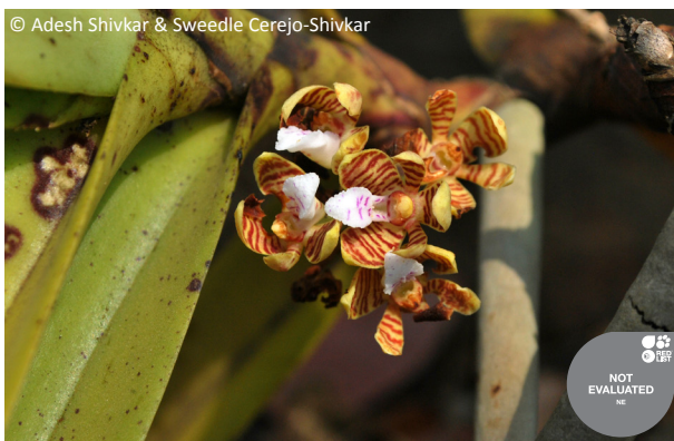
Image 3. Acampe praemorsa