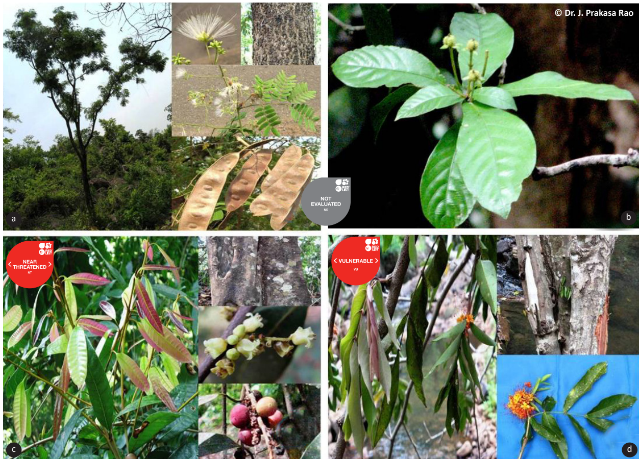
Image 1. a - Albizia thompsoni Brandis; b - Lasiococca comberi Haines; c - Nothopegia heyneana (Hook. f.) Gamble; d - Saraca asoca (Roxb.) de Wilde