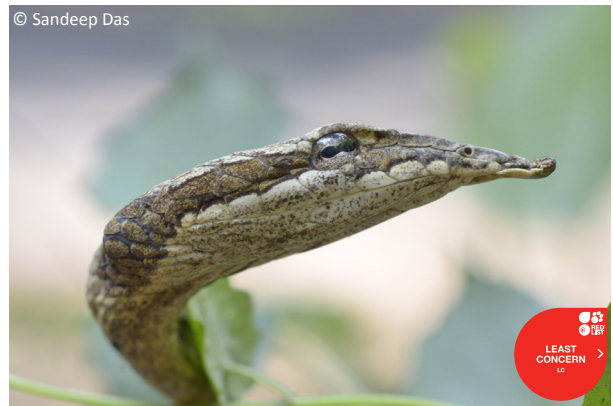
Image 2. Ahaetulla pulverulenta