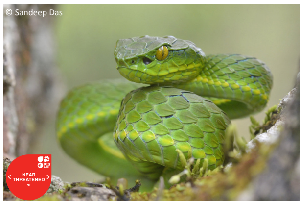
Image 6. Trimeresurus macrolepis