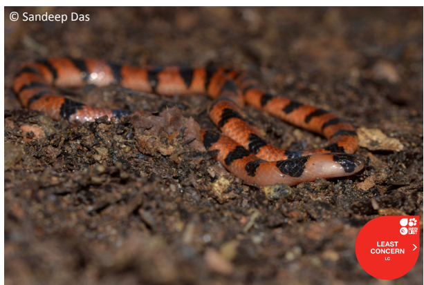
Image 4. Calliophis bibroni