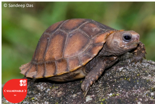
Image 11. Indotestudo travancorica