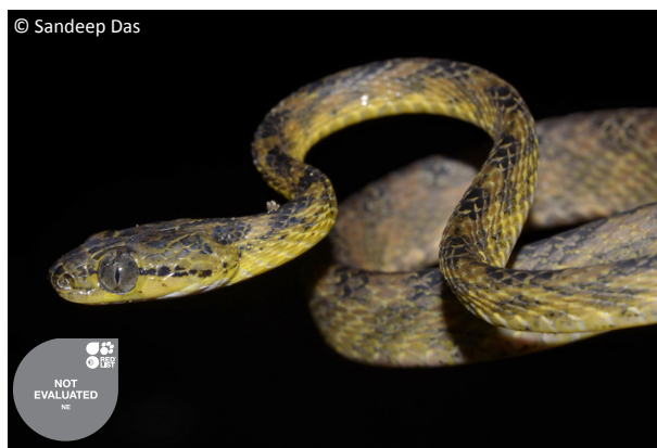
Image 3. Boiga ceylonensis