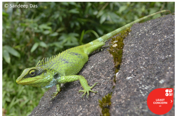
Image 8. Calotes grandisquamis