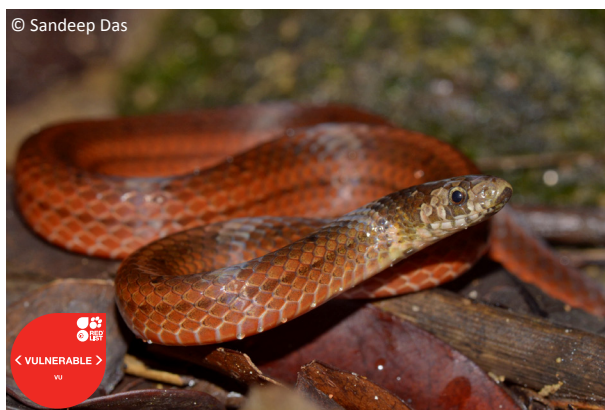
Image 5. Oligodon brevicauda