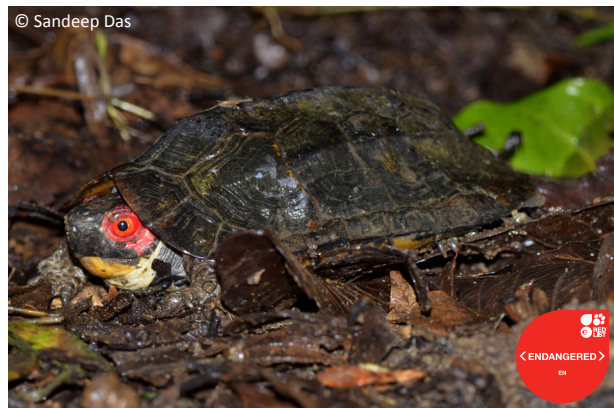
Image 12. Vijayachelys silvatica