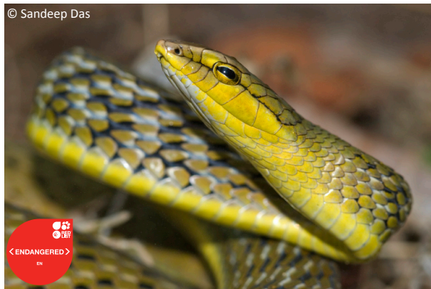
Image 1. Ahaetulla perroteti