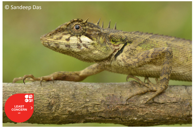
Image 10. Calotes ellioti