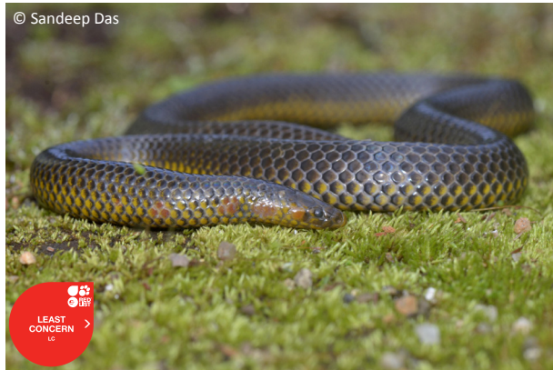
Image 7. Uropeltis rubromaculatus