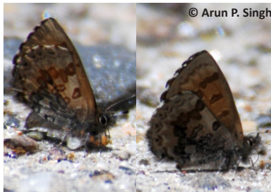
Image 3. Straightwing Blue Orthomiella pontis pontis Elwes