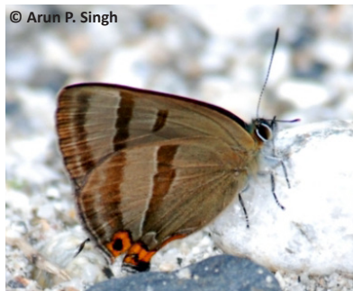
Image 5. Dull Green Hairstreak Esakiozephyrus icana Moore