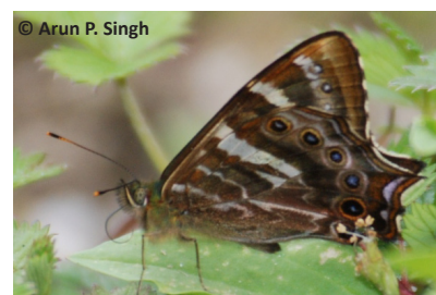
Image 7. Small Silverfork Zophoessa jalaurida elwesi Moore