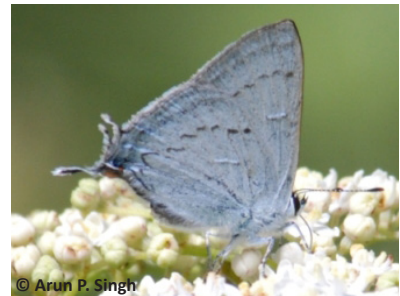
Image 4. Slate Royal Maneca bhotea bhotea Moore