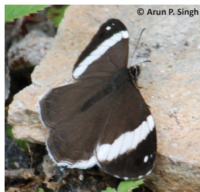
Image 9. Chumbi Wall Chonala masoni Elwes