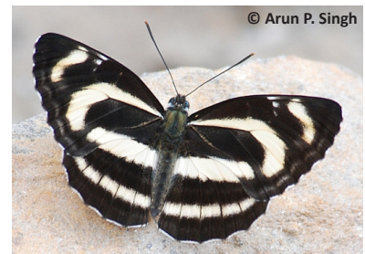
Image 10. Pale Hockeystick Sailer Neptis manasa manasa Moore