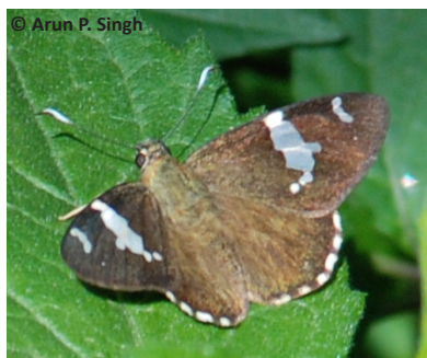
Image 12. Himalayan Spotted Flat Celaenorhinus munda Moore