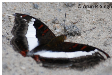
Image 11. White Commodore Parasarpa dudu dudu Westwood