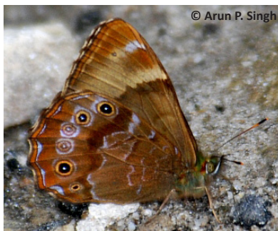
Image 6. Yellow Woodbrown Lethe nicetas Hewitson