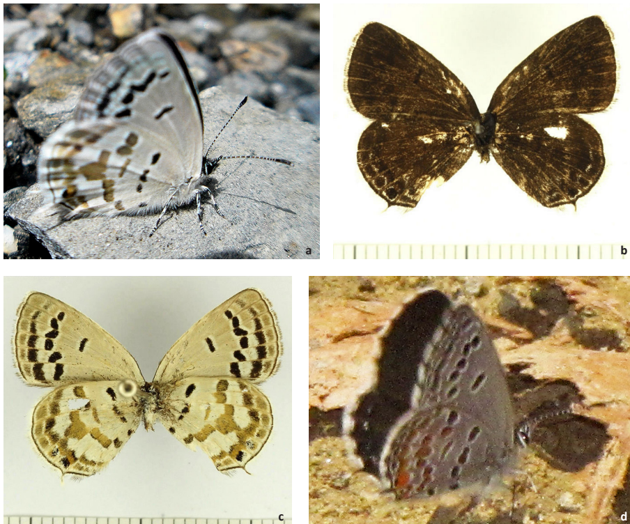
Image 1. a - Tongeia pseudozuthus , False Tibetan Cupid; © SNK; b - T. pseudozuthus UP; c - T. pseudozuthus UN from the specimen collected by PR, deposited at the Natural History Museum, London; d - T. kala , Black Cupid; © Vidya Venkatesh

During our visit, road improvement and widening activity was on-going, which escalated the disturbance levels. The recorded altitude of the site of collection, as per the hand-held Garmin GPS 60 CSX, at 3m accuracy, was 1,450 m (Fig. 1). The butterfly took off straight