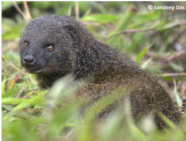
Image 1. Brown Mongoose Herpestes fuscus from Peppara Wildlife Sanctuary, Kerala (6 April 2013)