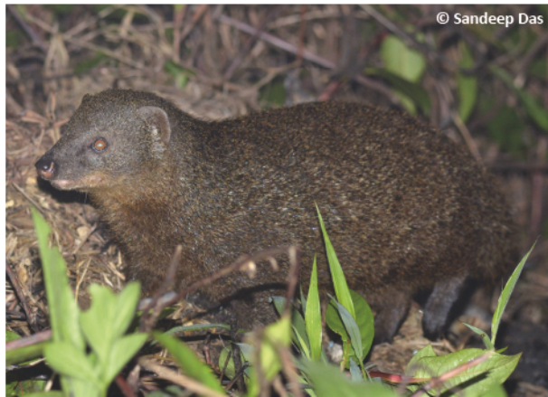
Image 3. Brown Mongoose Herpestes fuscus from Shendurney Wildlife Sanctuary, Kerala (22 November 2013)