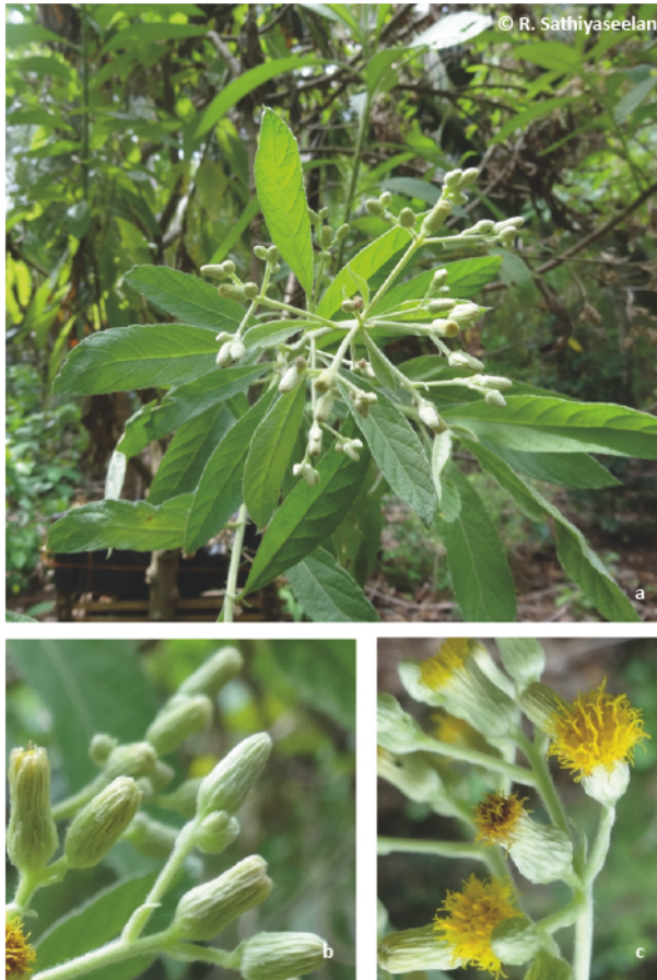
Image 1. Inula cappa (Buch.-Ham. ex D.Don) DC. a - Habit; b - Inflorescence; c - Flowers