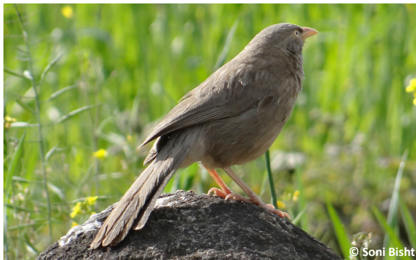
Image 1. Jungle Babbler Turdoides striata in the wild