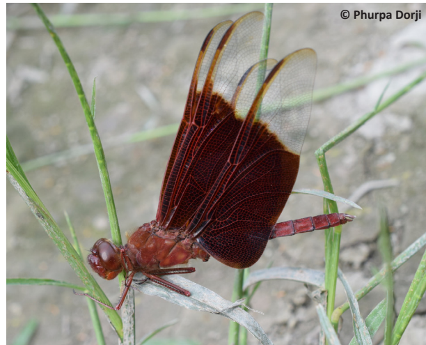
Images 1 & 2. Camacinia gigantea (Brauer, 1867), male, Nganglam, Pemagatshel.