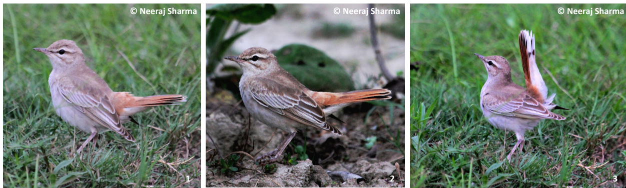
Images 1–3. 1 - Rufous-tailed Scrub Robin with notable pale supercilium, dark eye line and rufous rump; 2 - raised tail and drooping wings; 3 - tail over back with characteristic blackish sub-terminal band.

band on the tail, which were quite conspicuous for this specimen (Images 1–3). Subsequently, I cross-checked the photographs with sharp images available on online database (Bhatnagar 2004; Vang & Dabrowka 2005; Tiwari 2008; Balar 2009; Mishra 2009; Parekh 2009a,b; Turk 2009; Punjabi 2010; Das 2012; Saikia 2012; Mishra 2013; Bhardwaj 2014; Bhardwaj 2015; Chudasama 2015; Kuriakose 2013; Saikia 2015; www.orientalbirdimages.org ) with confirmation from Ali & Ripley (2001), Rasmussen & Anderton (2012), Grimmett et al. (2011), Grewal et al. (2016) to conclude that it was an adult Rufous-tailed Scrub Robin, a new record for the state of Jammu & Kashmir.