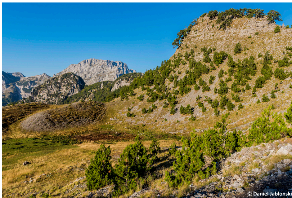
Image 1. An overview on the subalpine habitat of the species near Qafe e Terthores, Prokletije Mountains, Albania.

The trapping site was in the southwestern part of the Albanian Prokletije Mountains near Qafe e Terthores (42.390N & 19.726E; 1,626m; coordinates and elevations acquired using a Garmin 60CSx Global Positioning System unit and referenced to map datum WGS84). The newly discovered population of D. bogdanovi is located (airline distances) 32km from the nearest locality of the species in Montenegro and 62km from the locality in Kosovo (Kryštufek et al. 2007; Kryštufek & Bužan 2008). The habitat represents subalpine/alpine grassland and sparse pine forest ( Pinus heldreichii Christ, 1863) deposited on limestone, consisting of medium size rocks (>30cm in diameter). The trapping point was located on a steep slope with south orientation (Image 1). The specimen's body measurements were: weight 52g;