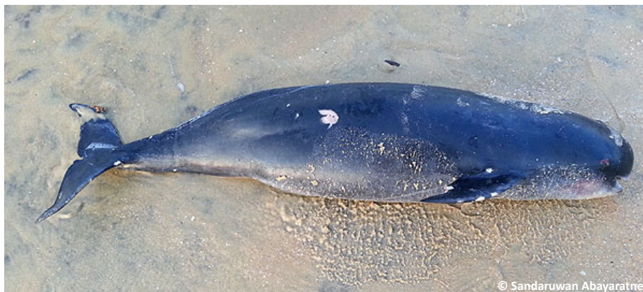
Image 1. Indo-Pacific Finless Porpoise specimen stranded in Sri Lanka

On 1 February 2014, a 120cm Indo-Pacific Finless Porpoise was washed ashore at Talaimannar at the western tip of Mannar Island (9.10750000 N & 79.73194444 E; Image 1). The specimen was measured and photographed. The external measurements were as follows: snout to centre of eye 6cm, snout to flipper 26.4cm, snout to umbilicus 68.4 cm, snout to genital slit 82cm, fluke width was 27cm. There were 18 teeth on