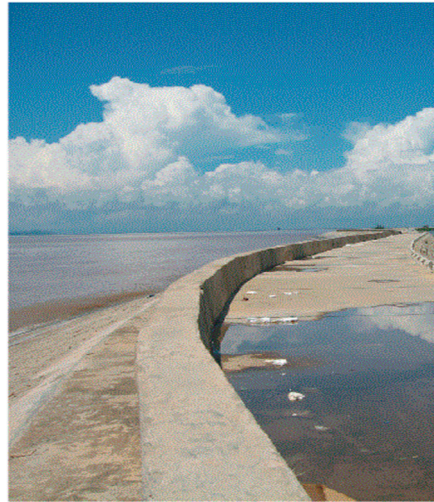
Figure 2. Seawall at Redcar Beach, North Yorkshire, UK.

water flow during flooding [44]. Flood mitigation using traditional structural measures is operative, but it is also vulnerable to the failure of any of the physical measures with the action of climate change phenomena. Taking in consideration that the construction of any of them is conditioned to the preservation of the environment, the provision of room for the water away from urban areas is vital to guarantee the safety of the community.